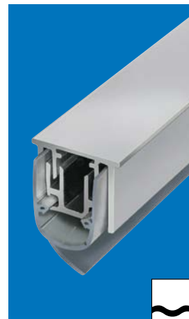
Option: Planet RS bevel lip for wavy floors