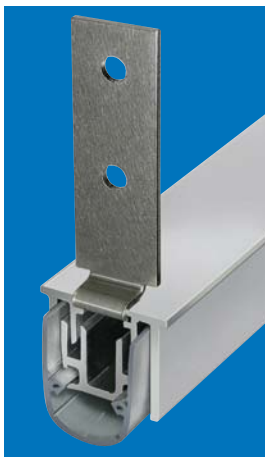
Optimized seal length with fastening bracket 4 mm, bent at right angles