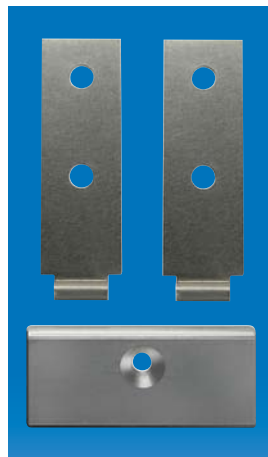
Optimized seal length with fastening bracket 4 mm, bent at right angles