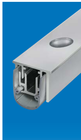
Option: Planet RS with Planet Drilling Ø 10,8 mm and 5×13 mm. Refer to chapter Flush bolt | Drilling