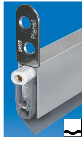
Planet RH with retaining bracket, release side