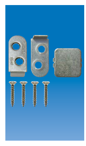
Planet assembly set HS