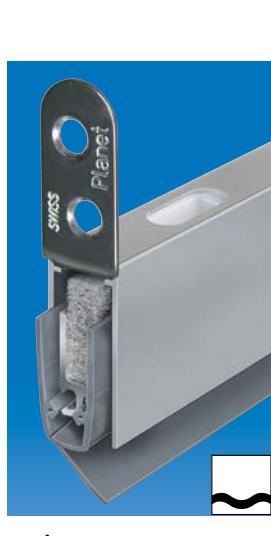
Option: Planet RH with Planet Drill hole 5×13 mm