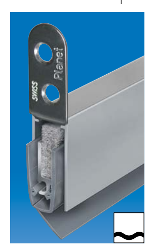
Planet RH profile