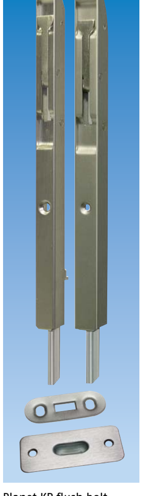
Planet KR flush bolt, incl. strike plate, refer to chapter Flush bolt | Drill hole.

Option: floor recess plate 5×13 mm, narrow