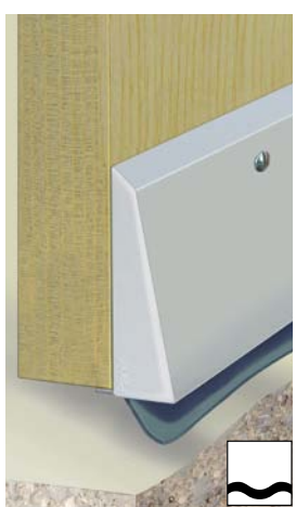
Option: Planet RF with Socle