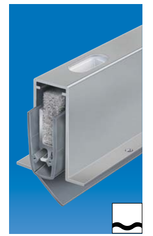
Option: Planet RF with Planet Drill hole 5×13 mm