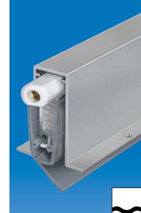
Planet RF, release side