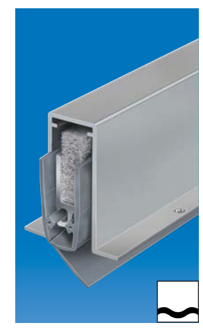
Planet RF profile