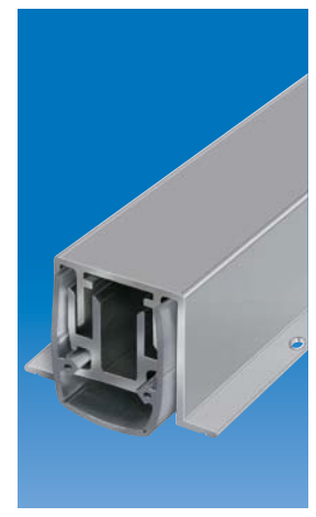
Planet PU profile