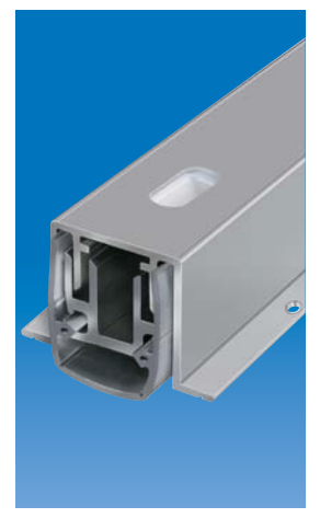
Option: Planet PU with Planet Drill hole 5×13 mm