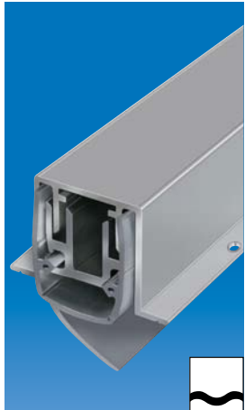
Option: Planet PU bevel lip for wavy floors