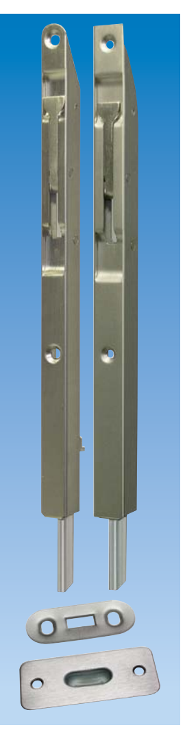
Planet KR flush bolt, incl. strike plate, refer to chapter Flush bolt | Drill hole. Option: floor recess plate 5×13 mm, narrow