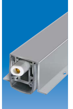
Planet PU with release knob