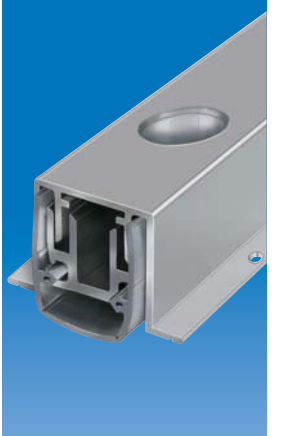
Option: Planet PU with Planet Drill hole \emptyset 10,8 mm