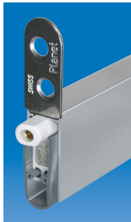
Planet HS with fastening bracket, release side