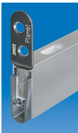
Option: Planet HS with Drill hole 5×13 mm