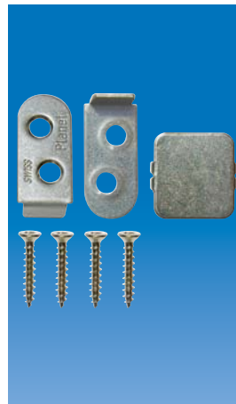
Planet assembly set HS