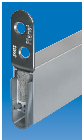
Planet HS profile