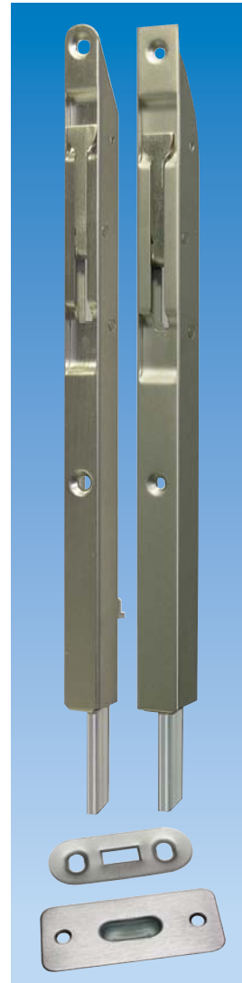
Planet KR flush bolt, incl. strike plate, refer to chapter Flush bolt | Drill hole.

Option: floor recess plate 5×13 mm, narrow