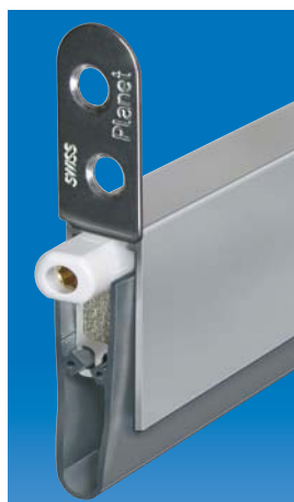
Option: Planet HS+8 with retaining bracket, release side