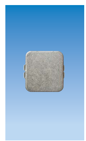
Planet Stopping plate type 1, stainless