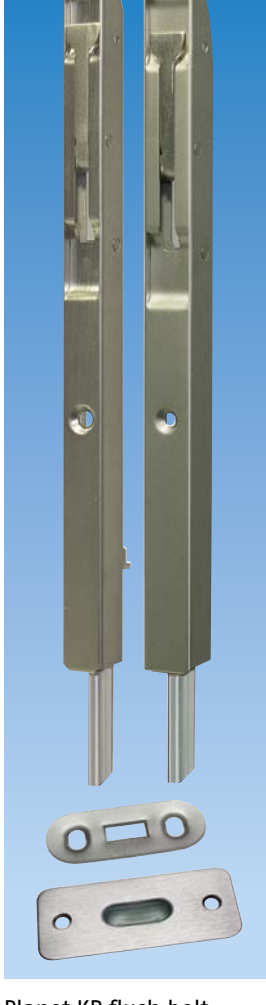
Planet KR flush bolt, incl. strike plate, refer to chapter Flush bolt | Drill hole.

Option: floor recess plate 5×13 mm, narrow