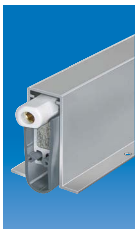
Planet FT, release side