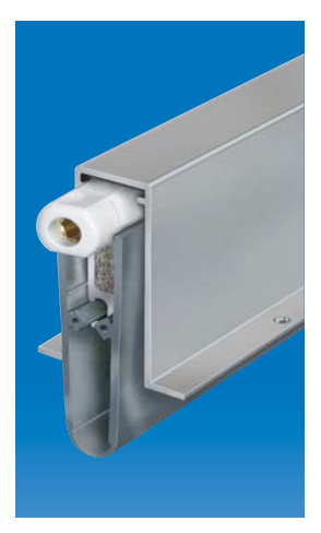
Option: Planet FT+8, release side