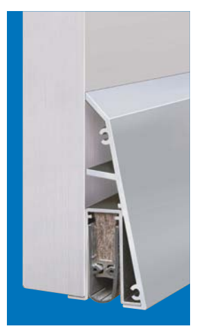
Option: Planet Socle without covering cap with Planet FT. Refer to chapter Planet Socle