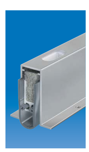
Option: Planet FT with Planet Drill hole 5×13 mm