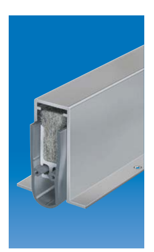
Planet FT profile