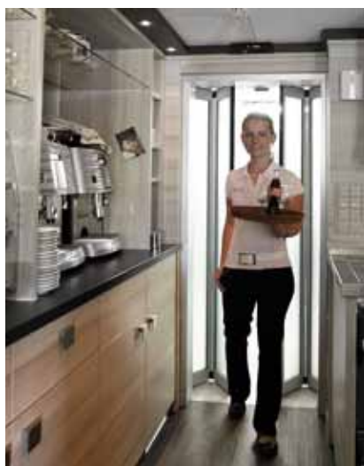
Automatic Gilgen folding door FFM for the maximum possible opening, even when space is limited.

The complete range of selectable functions and available control and safety elements enables you to find the optimal solution for your situation.